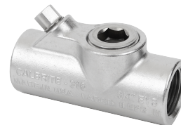
Calbrite™ EYS Sealing Fitting