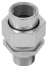
Calbrite™ UNY Union

Until recently, a stainless steel conduit raceway option was not available for use in hazardous environments. Calbrite™, a division of Calpipe Industries, Inc., now offers a complete package of stainless steel conduit and fittings suitable for use in hazardous locations. Fittings include Unions (Type UNY), Boxes (Type GUA), and Seals (Type EYS).