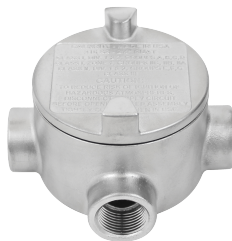
Calbrite™ GUA Box