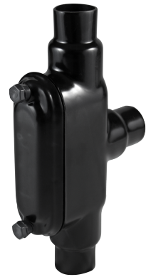
Calbond™ PVC Coated Form 8 Conduit Body

Under this solution, Galvanized Rigid Conduit (GRC) and fittings are coated with specially formulated Polyvinyl Chloride (PVC) on the exterior. In addition, the interior is coated with a urethane, providing an additional line of defense against corrosion. The PVC Coated “system” includes integral PVC sleeves that overlap and seal all threaded joints to ensure the integrity of the installation. Calbond™, a division of Calpipe Industries, Inc., manufactures a full line of PVC coated conduit and fittings that meet the industries highest standards of corrosion resistance, as well as being compliant with NEC® requirements for hazardous locations.