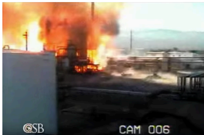
Surveillance footage of at the Silver Eagle Refinery.

Rigid metallic conduit (RMC) is a dependable solution for electrical raceways in hazardous environments. Accordingly, Manufacturers have developed fittings, enclosures, and accessories specifically for these systems which complement conduit for a safe and efficient installation.