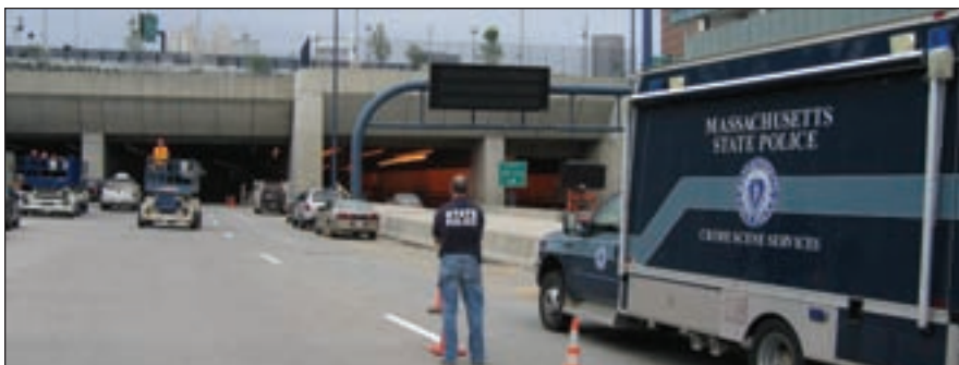
Citing alleged negligence and faulty workmanship, the Massachusetts attorney general declared the I-90 tunnel a crime scene. One section after another of the region's primary transportation systems was being shut down as inspections revealed unsafe conditions throughout the Big Dig tunnel system.

operator of the Big Dig tunnel system, they had a moral responsibility to inspect the Big Dig's tunnel ceilings. As the NTSB report stated, "No tunnel inspections were performed to determine the physical and functional condition of the ceiling system from the time the I-90 east bound connector tunnel was opened to traffic on January 18, 2003 until the day