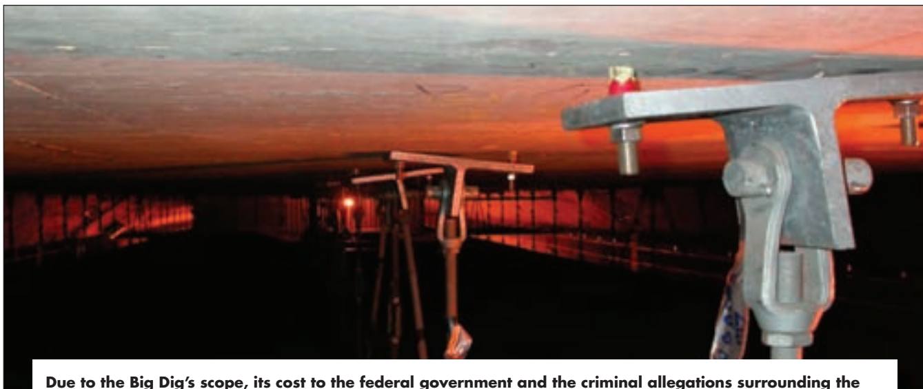
Due to the Big Dig's scope, its cost to the federal government and the criminal allegations surrounding the ceiling collapse, the Massachusetts Congressional delegation asked the National Transportation Safety Board (NTSB) to conduct a thorough investigation.

lays in service to the Silver Line, a transit line partially built by the Big Dig whose buses ran through the now-closed I-90 tunnel.