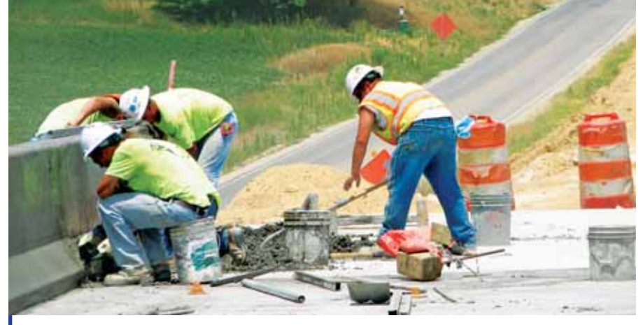
Southwest Indiana stands to benefit from improved access to jobs, education and health care with I-69. Pictured, crews pour sidewall on S.R. 61 interchange bridge in Pike County.

bridge; it's two, one for northbound and one for southbound lanes; the longest bridge in the corridor."