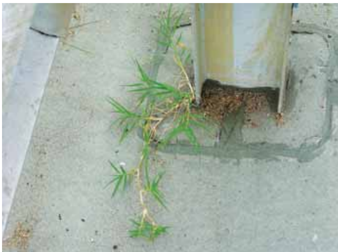
The picture above shows Bermuda grass growing around guardrail beam where caulk malfunctioned.

Hand-trimmed plots required trimming twice a year for the first two years