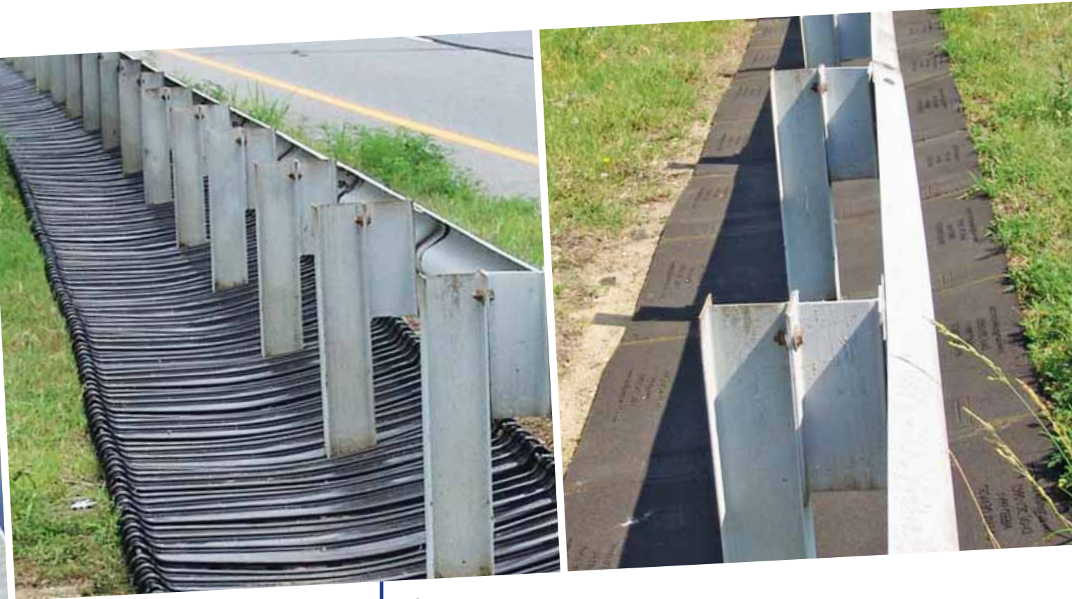
Left to right: U-Teck WeedEnder standard cut, U-Teck WeedEnder custom cut, Universal Weed Cover, Traffix. All are guardrail treatments studied in Delaware.

feasible because of mower size and the inability to maneuver the mowing head around and under the guardrails. Hand trimming is time consuming and labor intensive as well as dangerous because of operator exposure working between traffic and the barriers.