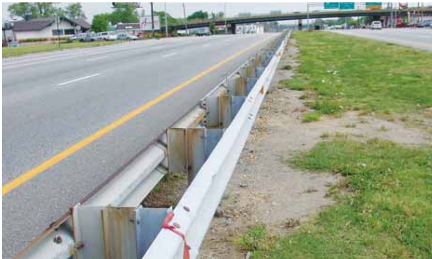
Irregular edge between herbicide-treated guardrail zone and median vegetation.