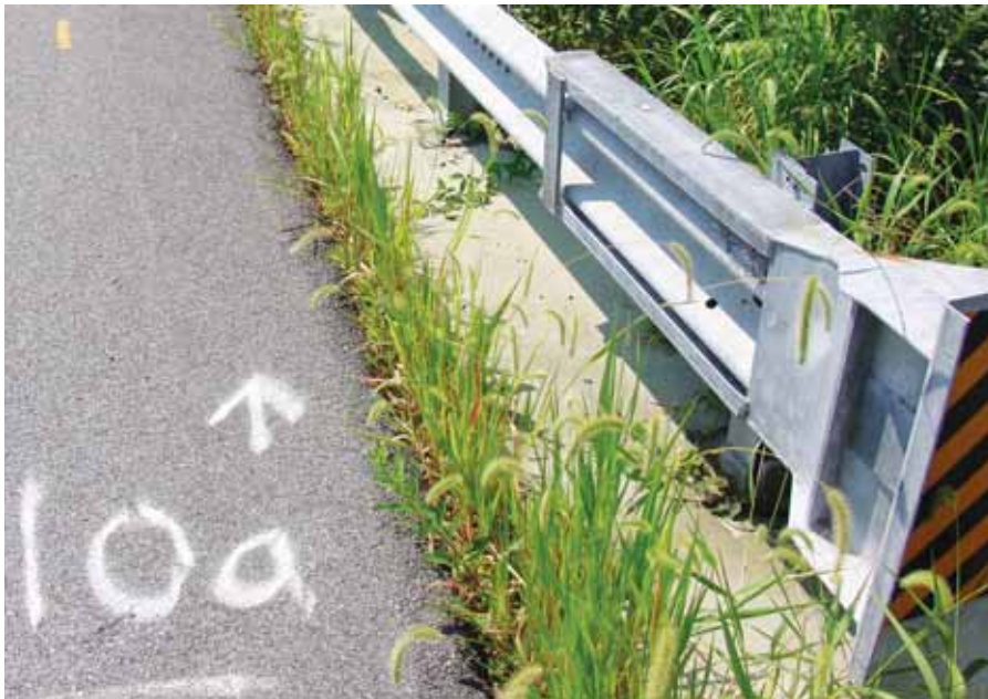
Strip between weed barrier and pavement allowing weed growth.

use, so alternative control measures must compare favorably with herbicide use in terms of effectiveness, cost, environmental impact and aesthetics.