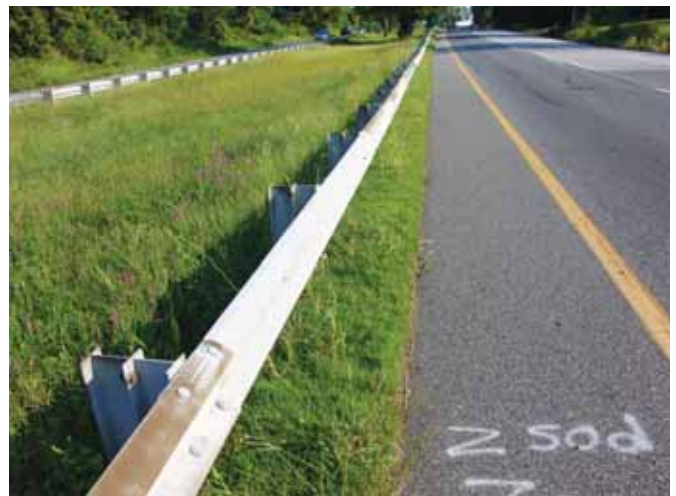
The study revealed that zoysiagrass sod provided a competitive, low maintenance vegetative cover under guardrail.