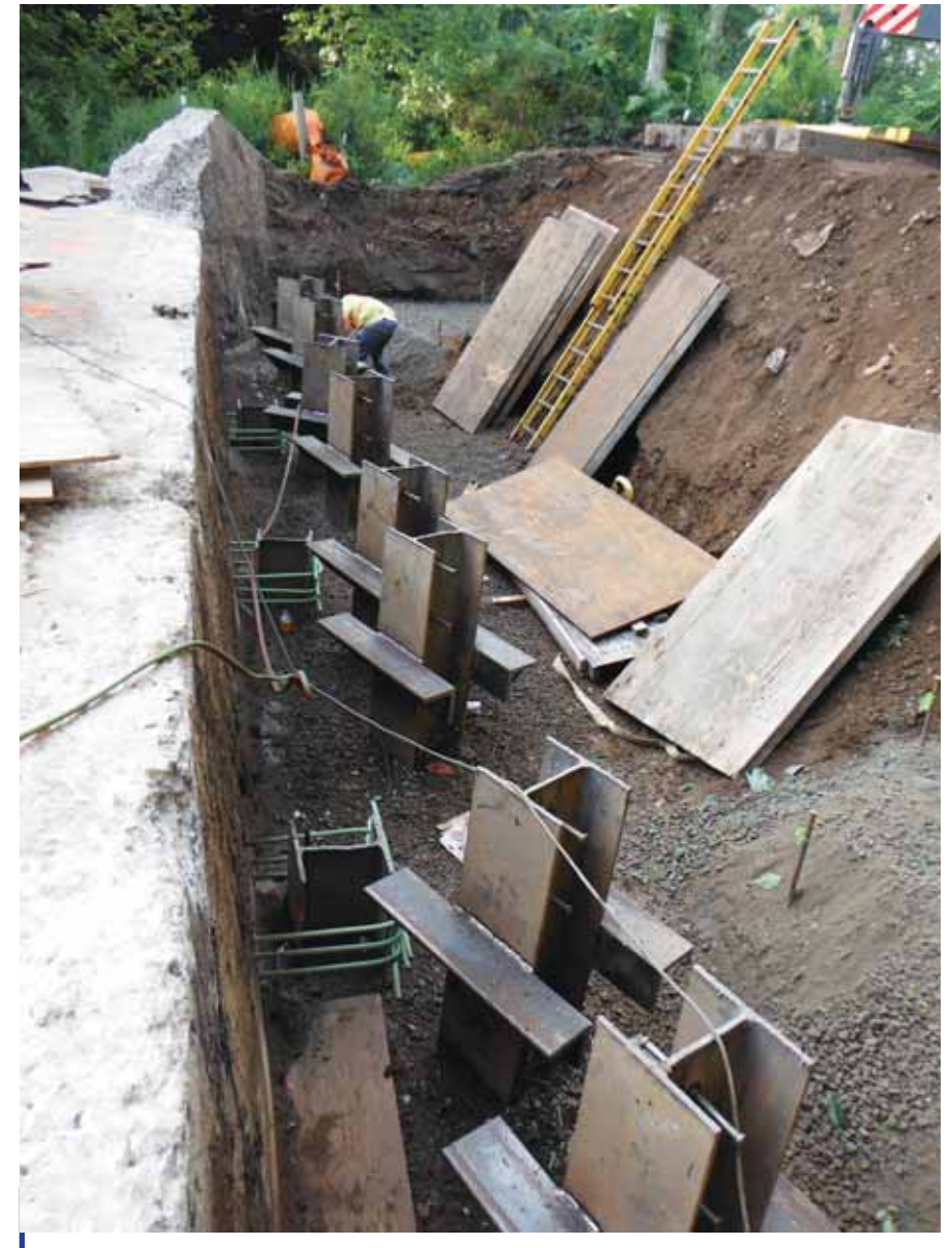
Construction staging was designed to keep all construction impacts within the footprint of the existing road and bridge. This resulted in no disturbance to the surrounding area.

In preparation for the seven-day closure, all components must be manufactured to exact tolerances to allow the system to come together like a Lego set. A mockup of the system is needed at the precast yard to verify all pieces fit together, avoiding any field surprises. The one component that could not be checked at the precast yard would be the alignment of the piles once driven, since the piles must sit in voids precast into the substructure. Although there was