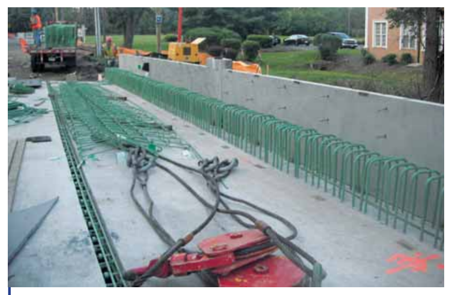
Four new 92-ft-long precast superstructure units consisting of dual steel-plate girder stringers in composite action with a reinforced high-performance concrete deck were installed atop new bearings. The longitudinal joints were filled with quick-setting cement.

An asphalt bridge deck waterproofing surface course was placed over the bridge once the parapets were installed. There was significant discussion during design on whether to use an asphalt overlay on a newly constructed bridge deck. Even very minor differences in elevation would be noticeable on the exposed deck. Given the rapid construction, there would be little time to correct any elevation issues should they arise. The asphalt was eventually used since it can be compared to icing on a cake that would smooth out any imperfections to the motoring public. The final elevations on the concrete deck did come out near