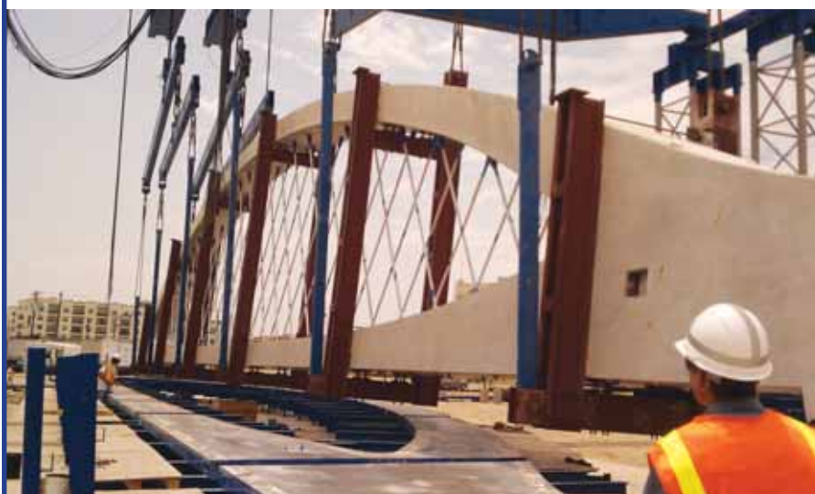
Each arch weighs about 590,000 lb. They are cast while lying flat on their sides, then post-tensioned. After they cure to a strength of 6,000 psi, they are rotated into a vertical position and shifted into storage. Each arch takes about four weeks to complete.